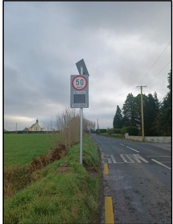
Completed speed safety signage at Ballydaly

The village enhancements to Clondrohid were agreed with the local groups and are continuing.