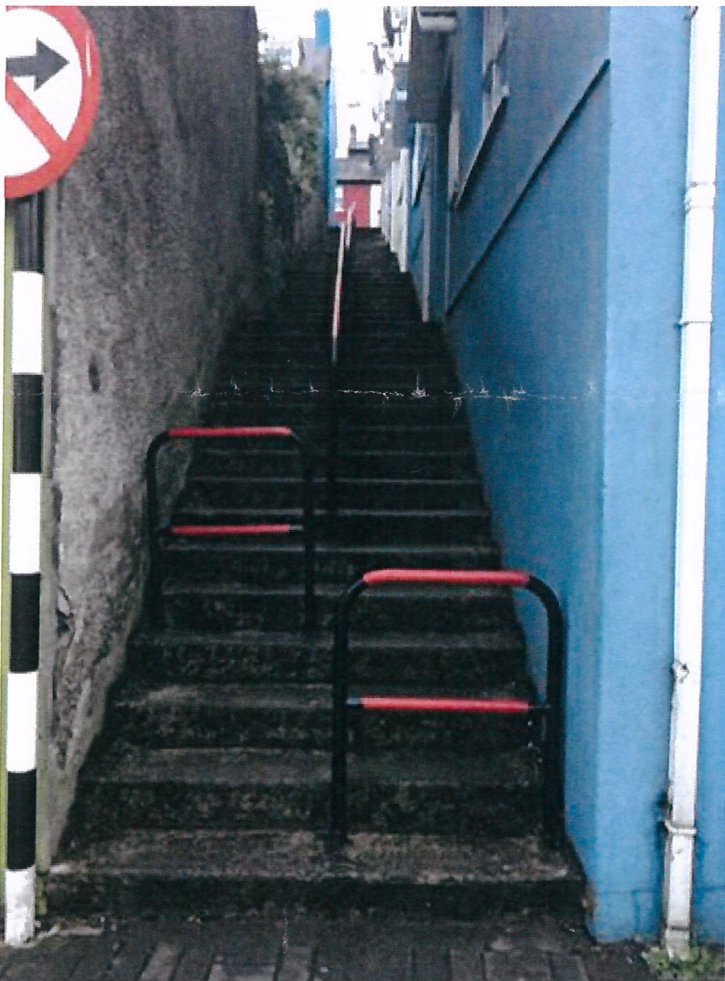
(Steps at present)

As part of 2020's Town Development fund the County Council Arts Officer and MD Officer went to the market for artists to paint the Stony Steps in Kinsale, a project the Chamber of Tourism are very supportive of. Splattervan were the artists who won the competition.