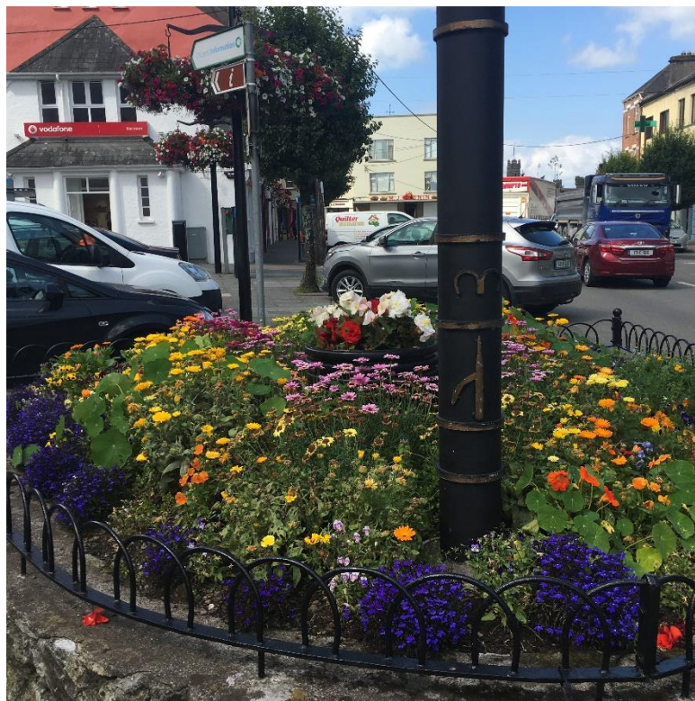
Figure 3 Example of newly planted flowers in Macroom