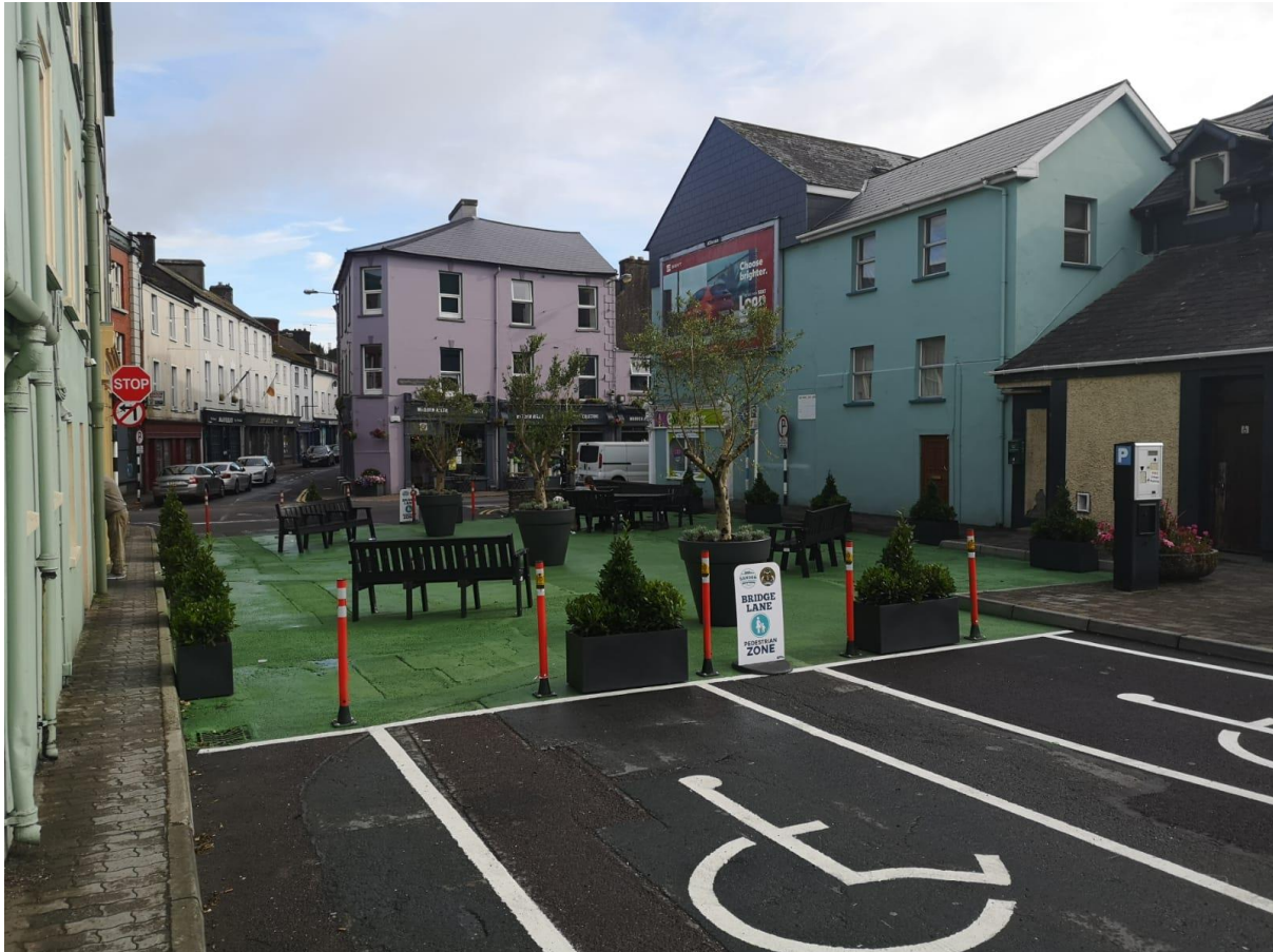
Figure 5 Example of pedestrian plaza in Bandon