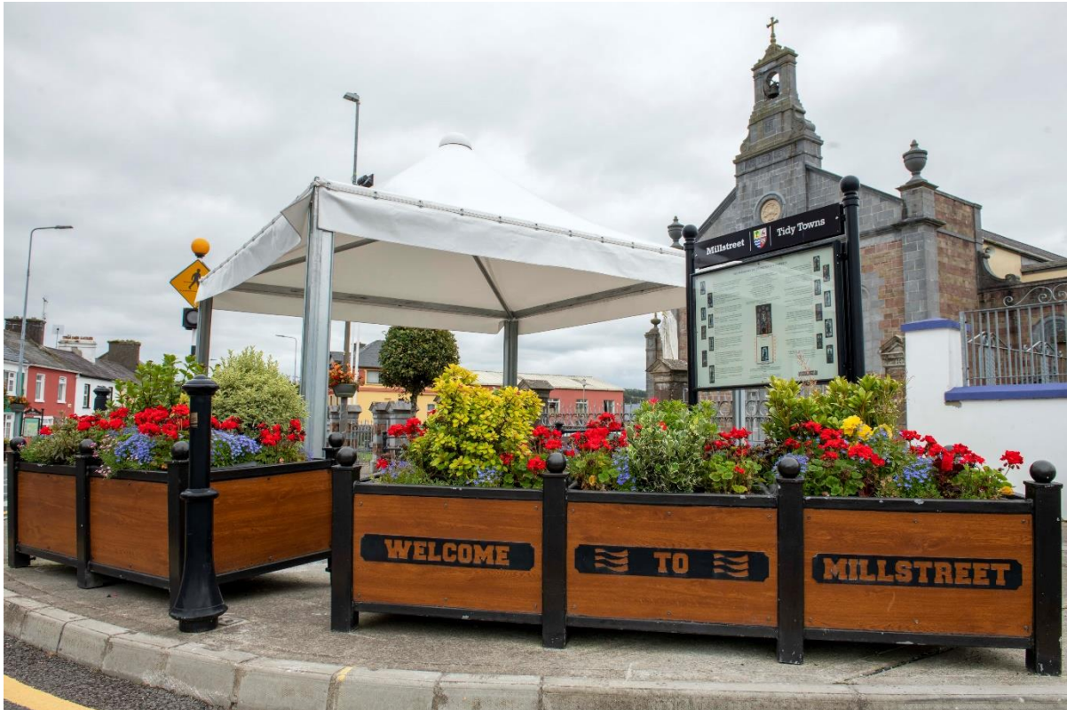
Figure 4 Example of canopy in Millstreet