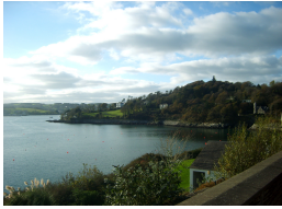
S81 Scenic Route