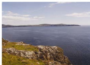
pNHA - 0109 Three Castle Head to Mizen Head