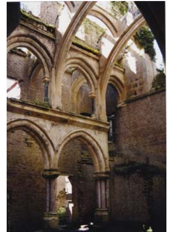
RPS No. 00764 Detail from Dunboy Castle Country House