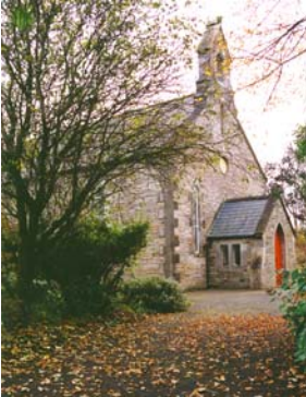
RPS No. 01005 Former Church of Ireland