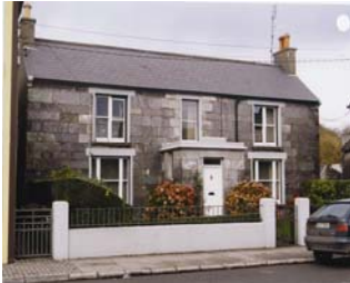
RPS No. 00871 Stone Dwelling