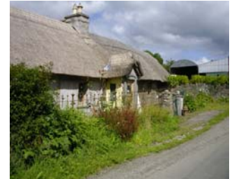
RPS Nos. 00268 Thatch House Gortmore