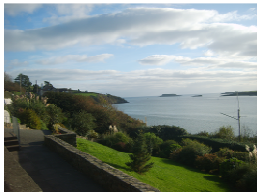
S81 Scenic Route