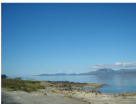
S110 Scenic Route

See also Appendix B for a more detailed description of each Scenic Route.