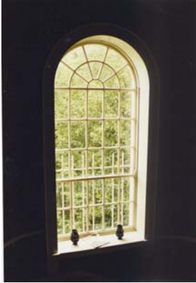
RPS No. 00502 Detail from Ditchley House