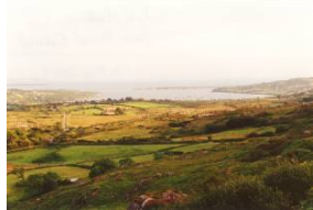
S96 Scenic Route