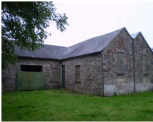
RPS No. 00003 Scart School