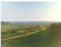
S93 Scenic Route