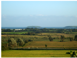
S46 Scenic Route