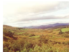
S29 Scenic Route