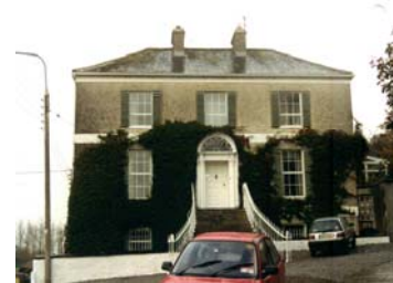
RPS No. 01206 Detached House at Egmont Place