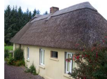
RPS Nos. 00713 Thatch House Ballinteosig