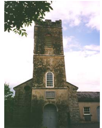
RPS No. 00074 St. Colman's Church, Farahy