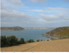
S51 Scenic Route