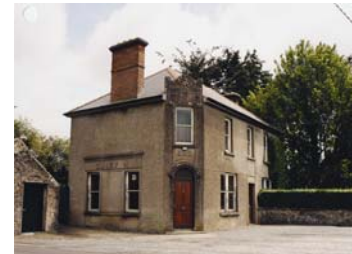
RPS No. 01242 Griffen's Bar