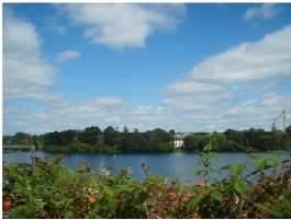
S38 Scenic Route

The plan has identified specific Scenic Routes consisting of important and valued views and prospects within the County. The established scenic routes include a variety of images, which relate to impressive or beautiful natural scenery. Scenic routes act as indicators of high value landscapes and identify more visually sensitive locations where higher standards of design, siting and landscaping are required.