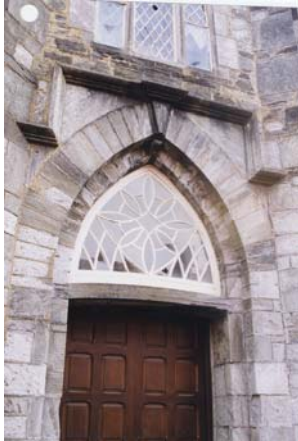
RPS No. 00898 Detail from St. Brendan's Church of Ireland