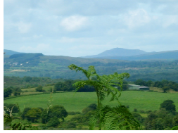
S35 Scenic Route