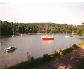
S58 Scenic Route