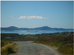
S110 Scenic Route