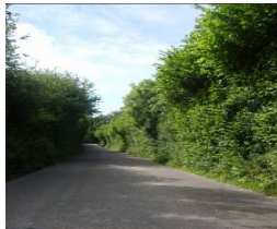
S8 Scenic Route