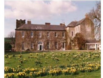
RPS No. 00602 Ballymaloe House