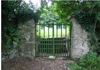
RPS No. 00248 Macronee Church (In-Ruins)