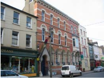
RPS No. 00975 AIB Bank