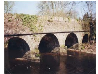
RPS No. 00394 Riverstown Bridge