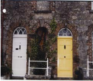
RPS Nos. 00115 and 00116 Front Doors of Kingston College, Mitchelstown