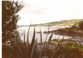
S97 Scenic Route