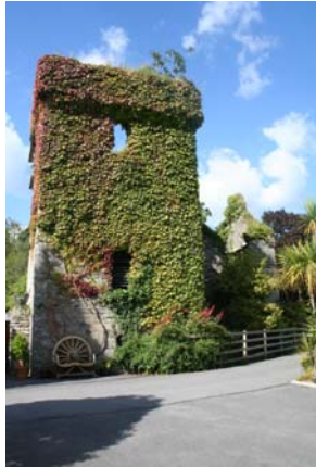
RPS Nos. 00368 Slievereagh Ornamental Tower