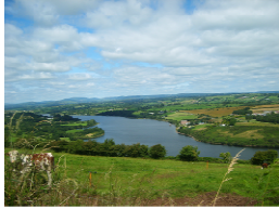
S28 Scenic Route