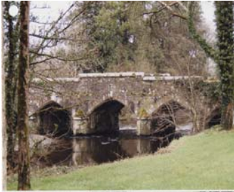
RPS No. 01186 Wallis' Bridge at Drishane Estate