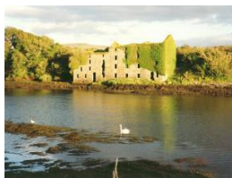
S108 Scenic Route