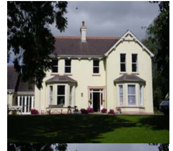
RPS No. 00025 Ballinwillan Lodge