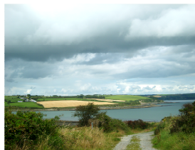
S70 Scenic Route