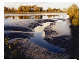
pNHA - 1046 Douglas River Estuary