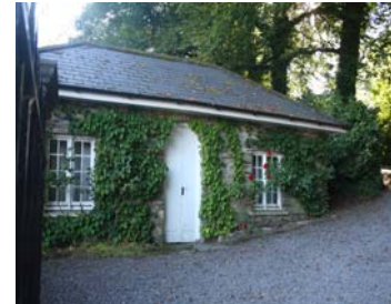
RPS Nos. 00895 Beach House Beach