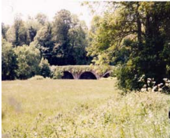
RPS No. 00293 Killavullen Bridge