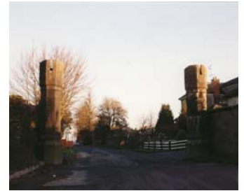
RPS No. 1078 Gate Piers at entrance to Dairygold (formerly Mitchelstown Castle)