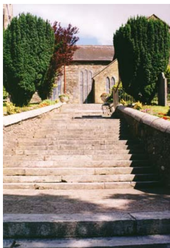
Bandon ACA (part of)