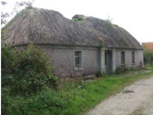
RPS Nos. 00541 Thatch House Killabraher