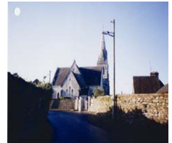
RPS No. 00481 St. Lukes Church of Ireland