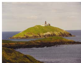
pNHA - 1978 Ballycotton Islands