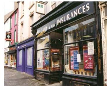
RPS No. 1038 Shopfront, Charleville