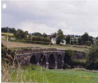
RPS No. 00221 Ballykenly Bridge