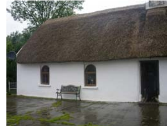
RPS No. 00111 Thatch House