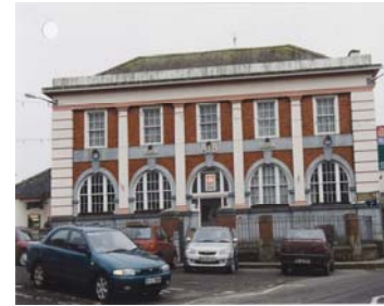
RPS No. 01178 AIB Bank