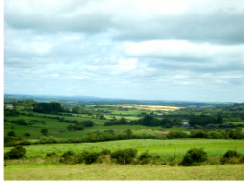
S36 Scenic Route