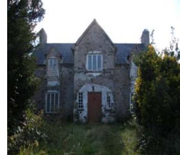
RPS No. 01288 House, Glentrasna