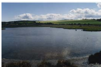
pNHA - 1547 Castletownsend