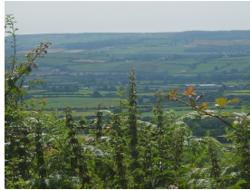
S8 Scenic Route