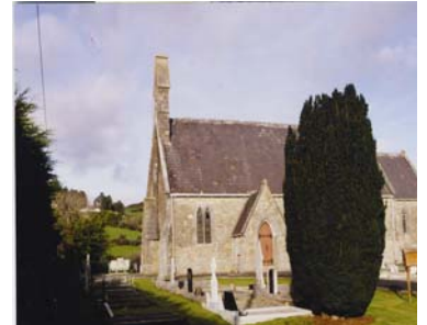
RPS No. 00945 St. Peter's Church of Ireland