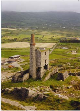
RPS No. 00739 Man- Engine House