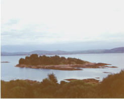
S113 Scenic Route