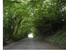
S65 Scenic Route