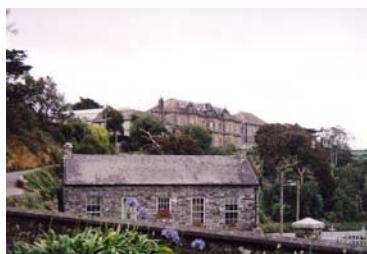
Rosscarbery ACA (part of)