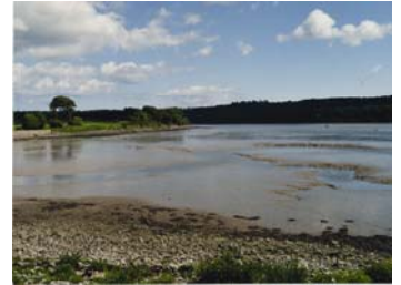
pNHA - 1990 Owenboy River