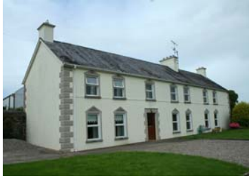
RPS No. 00085 Stanards Grove Country House