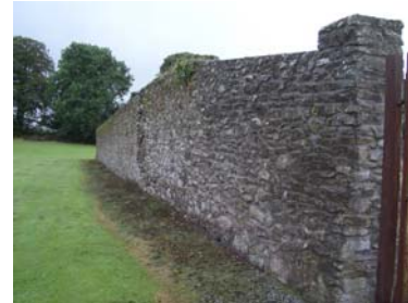
RPS Nos. 00444 Walled Garden of Former Protestant Rectory