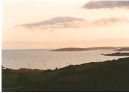
S90 Scenic Route