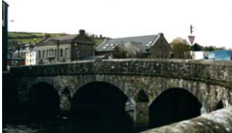
RPS No. 00952 Bandon Bridge