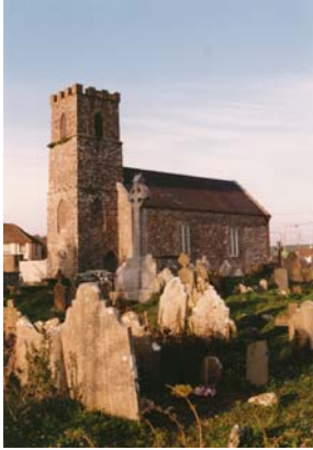
RPS No. 00409 Killeagh Church of Ireland