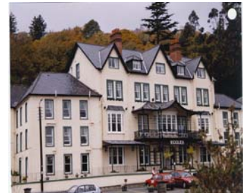
RPS No. 00672 Eccles Hotel