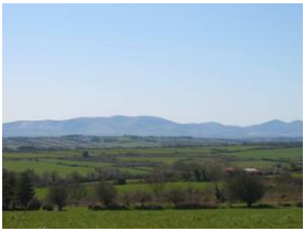
S17 Scenic Route