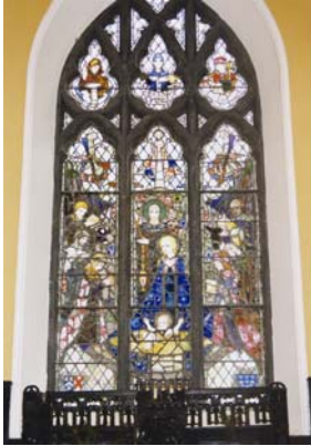
RPS No. 00788 St. Barrahanes Church of Ireland (Harry Clarke Windows)