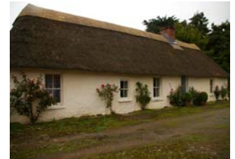
RPS Nos. 00230 Thatch House Derryvillane