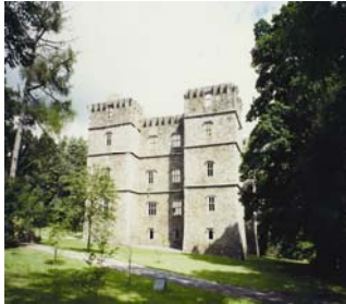
RPS Nos. 00178 Kanturk Castle