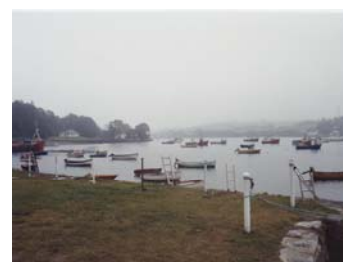
pNHA - 1547 Castletownsend