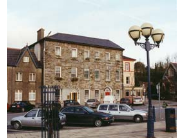
RPS No. 00927 Townhouse – O Mahony Farrelly, Bantry