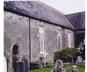
RPS No. 00790 Ross Church of Ireland Cathedral