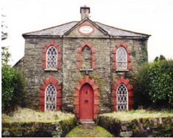
RPS No. 00705 Castle Cottages (No.1)