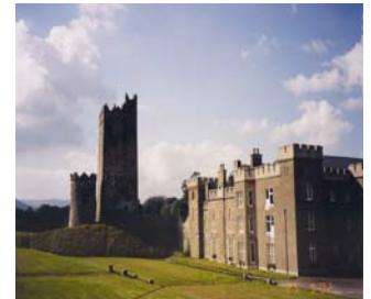
RPS No. 00319 and 00320 Drishane Country House and Castle