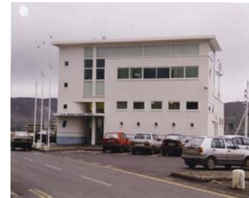
RPS No. 01001 BIM Regional Fisheries Centre