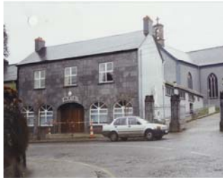
RPS No. 01213 CYMS Newmarket