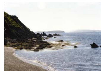
cSAC - 0101 Roaringwater Bay & Islands