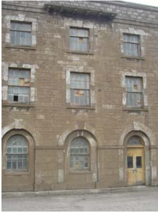
RPS Nos. 00670 Range of Limestone Warehouses and Offices, Haulbowline Island