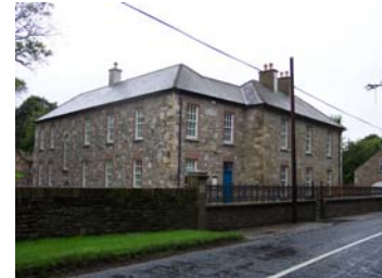
RPS Nos. 00354 Kilmacow House Kilmacow