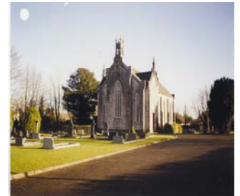
RPS No. 00564 Frankfield Church of Ireland