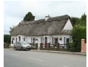
RPS Nos. 00185 Thatch House Derrynatubrid