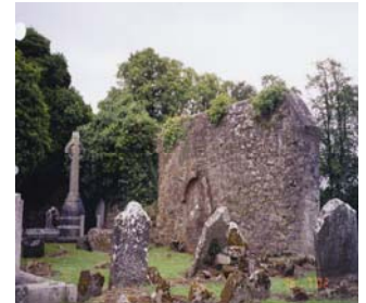
RPS No. 00844 Ballyhay Church in Ruins