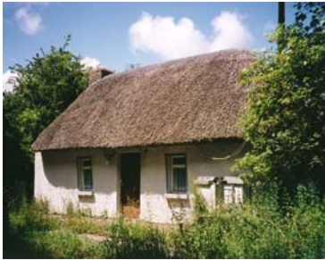
RPS No. 01144 Thatch House Ballywalter