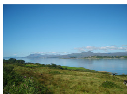
S110 Scenic Route