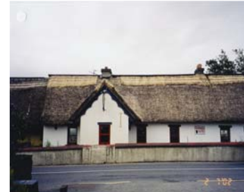
RPS No. 00518 Thatch House Dromina Village