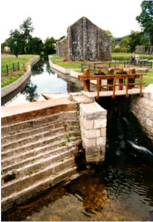
RPS No. 00818 Ballincollig Gunpowder Mills