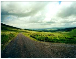
S20 Scenic Route