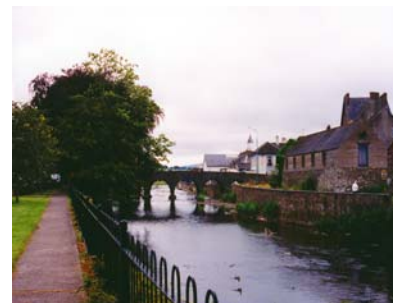
Kanturk ACA (part of)