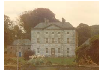
RPS No. 00644 Crosshaven House