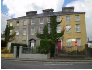
RPS Nos. 01066 Number 3 of Terrace of Three Dwellings (Avondale)