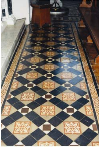
RPS No. 00571 Detail from Monkstown Catholic Church