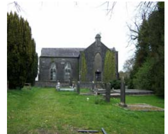
RPS Nos. 00161 Christ Church (Church of Ireland), Newmarket