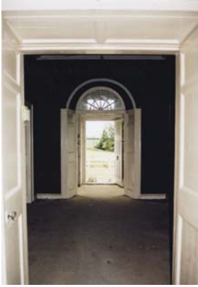
RPS No. 00343 Detail from Aghern House