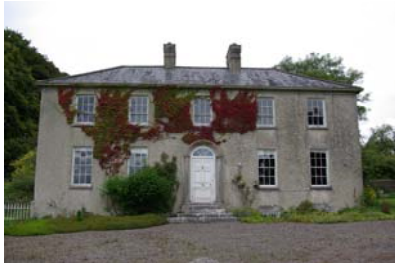
RPS No. 00046 Ballyellis House