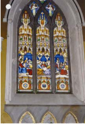
RPS No. 00628 St. Mary's Catholic Church