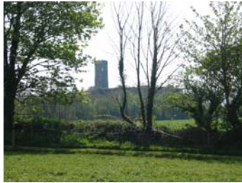
RPS No. 00467 Ballincollig Castle