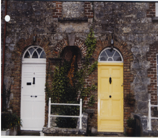
RPS Nos. 00115 and 00116 Front Doors of Kingston College, Mitchelstown