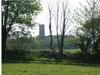
RPS No. 00467 Ballincollig Castle