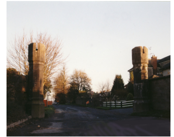
RPS No. 1078 Gate Piers at entrance to Dairygold (formerly Mitchelstown Castle)