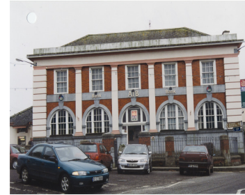
RPS No. 01178 AIB Bank