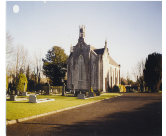
RPS No. 00564 Frankfield Church of Ireland