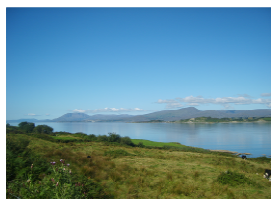
S110 Scenic Route