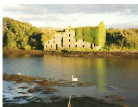
S108 Scenic Route