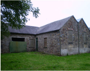
RPS No. 00003 Scart School