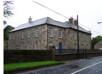
RPS Nos. 00354 Kilmacow House Kilmacow