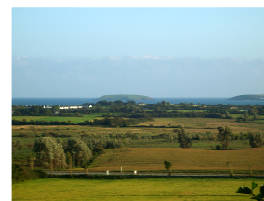
S46 Scenic Route