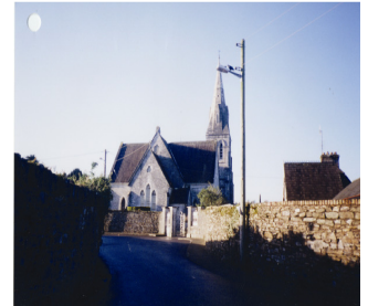
RPS No. 00481 St. Lukes Church of Ireland