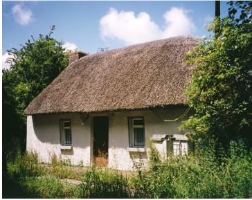
RPS No. 01144 Thatch House Ballywalter