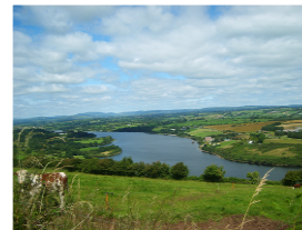
S28 Scenic Route