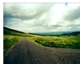
S20 Scenic Route