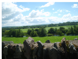
S38 Scenic Route