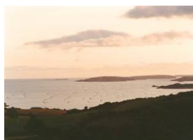
S90 Scenic Route