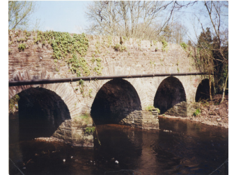
RPS No. 00394 Riverstown Bridge