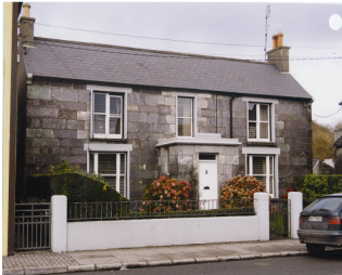
RPS No. 00871 Stone Dwelling