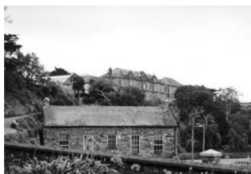
Rosscarbery ACA (part of)