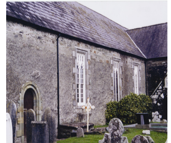
RPS No. 00790 Ross Church of Ireland Cathedral