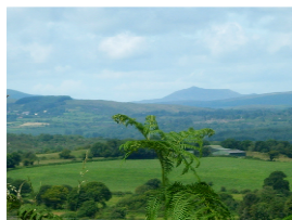
S35 Scenic Route