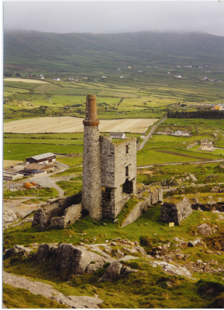
RPS No. 00739 Man- Engine House