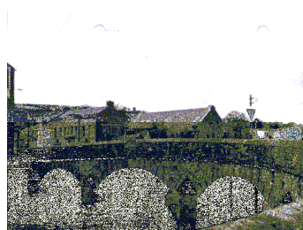
RPS No. 00952 Bandon Bridge