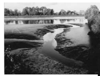
pNHA - 1046 Douglas River Estuary