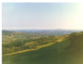
S93 Scenic Route