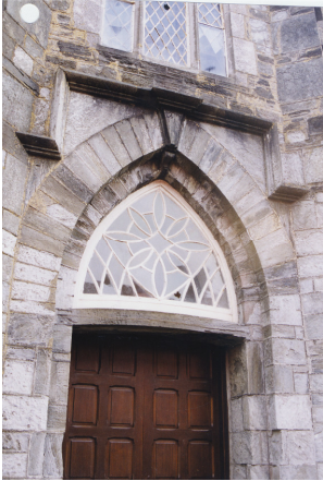
RPS No. 00898 Detail from St. Brendan's Church of Ireland