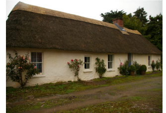
RPS Nos. 00230 Thatch House Derryvillane