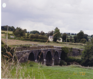
RPS No. 00221 Ballykenly Bridge