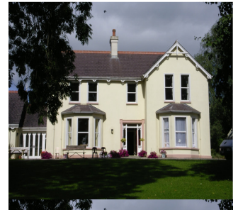
RPS No. 00025 Ballinwillan Lodge