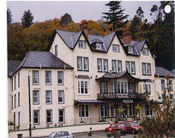
RPS No. 00672 Eccles Hotel