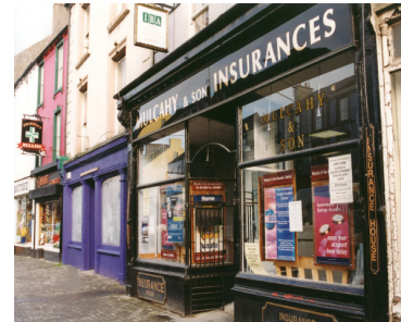
RPS No. 1038 Shopfront, Charleville