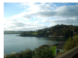
S81 Scenic Route