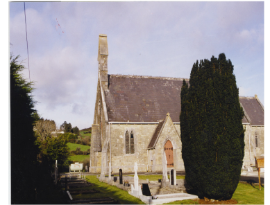
RPS No. 00945 St. Peter's Church of Ireland