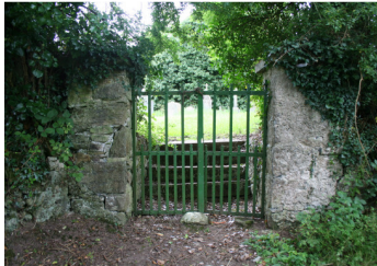
RPS No. 00248 Macronee Church (In-Ruins)