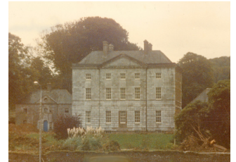
RPS No. 00644 Crosshaven House