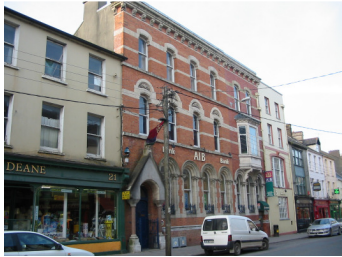
RPS No. 00975 AIB Bank