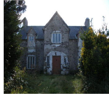
RPS No. 01288 House, Glentrasna