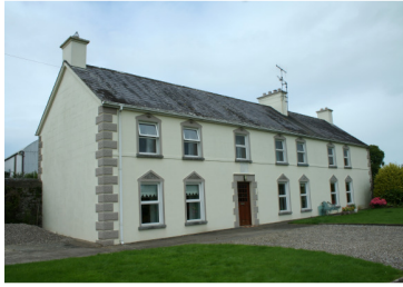
RPS No. 00085 Stanards Grove Country House