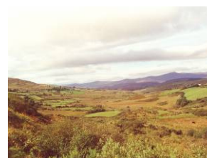
S29 Scenic Route