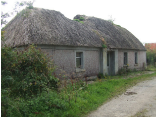
RPS Nos. 00541 Thatch House Killabraham