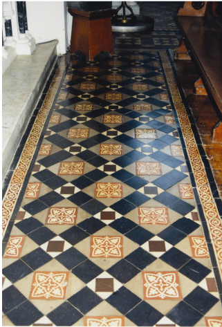
RPS No. 00571 Detail from Monkstown Catholic Church