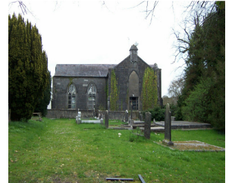
RPS Nos. 00161 Christ Church (Church of Ireland), Newmarket