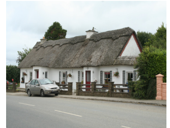
RPS Nos. 00185 Thatch House Derrynatubrid