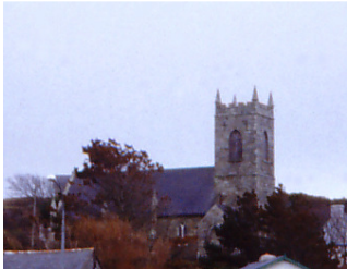
RPS No. 01250 Baltimore Church of Ireland