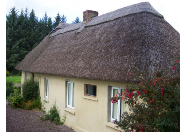
RPS Nos. 00713 Thatch House Ballinteosig