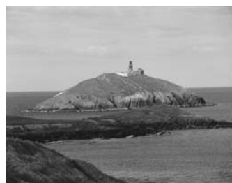
pNHA - 1978 Ballycotton Islands