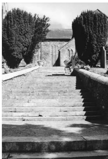
Bandon ACA (part of)