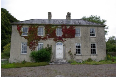
RPS No. 00046 Ballyellis House