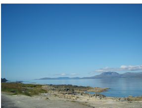
S110 Scenic Route

See also Appendix B for a more detailed description of each Scenic Route.