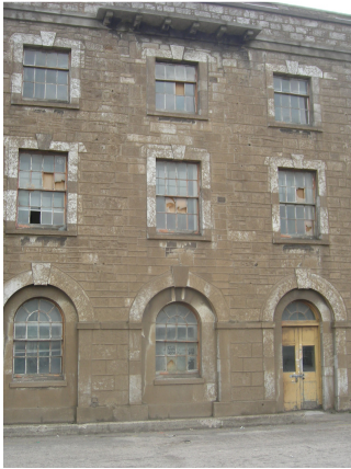
RPS Nos. 00670 Range of Limestone Warehouses and Offices, Haulbowline Island