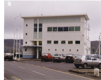
RPS No. 01001 BIM Regional Fisheries Centre