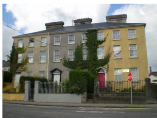
RPS Nos. 01066 Number 3 of Terrace of Three Dwellings (Avondale)