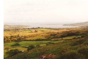
S96 Scenic Route