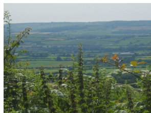
S8 Scenic Route