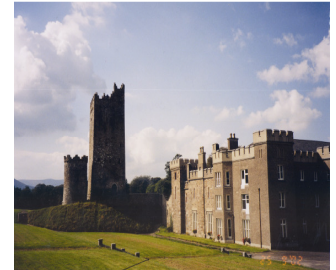
RPS No. 00319 and 00320 Drishane Country House and Castle