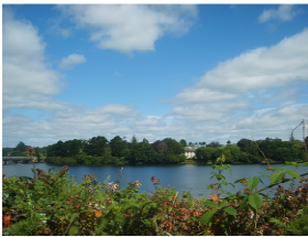
S38 Scenic Route

The plan has identified specific Scenic Routes consisting of important and valued views and prospects within the County. The established scenic routes include a variety of images, which relate to impressive or beautiful natural scenery. Scenic routes act as indicators of high value landscapes and identify more visually sensitive locations where higher standards of design, siting and landscaping are required.