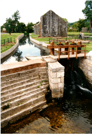
RPS No. 00818 Ballincollig Gunpowder Mills