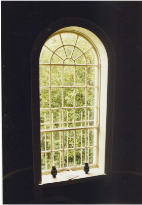
RPS No. 00502 Detail from Ditchley House