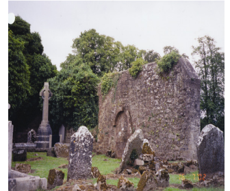
RPS No. 00844 Ballyhay Church in Ruins