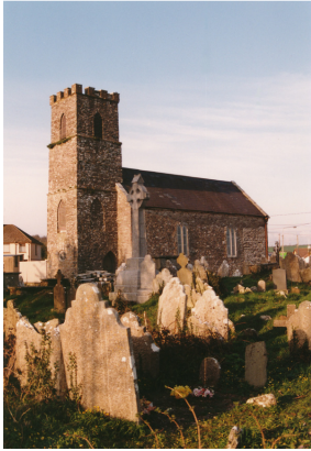
RPS No. 00409 Killeagh Church of Ireland