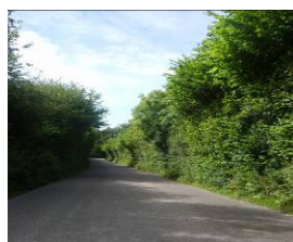
S8 Scenic Route