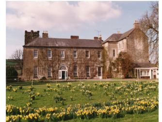
RPS No. 00602 Ballymaloe House