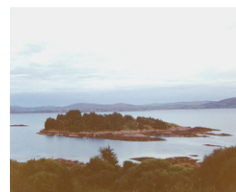
S113 Scenic Route