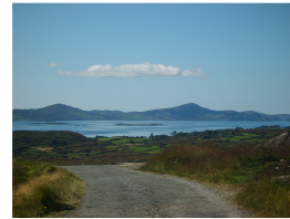
S110 Scenic Route