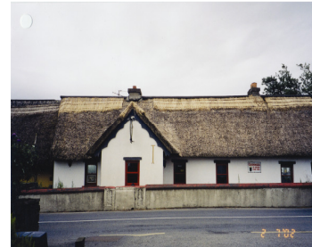
RPS No. 00518 Thatch House Dromina Village