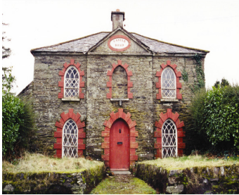
RPS No. 00705 Castle Cottages (No.1)