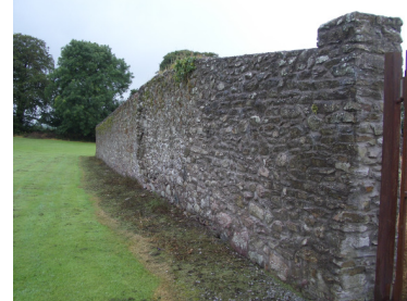
RPS Nos. 00444 Walled Garden of Former Protestant Rectory