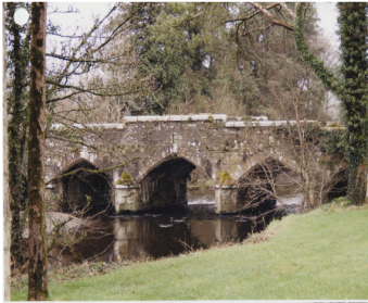
RPS No. 01186 Wallis' Bridge at Drishane Estate