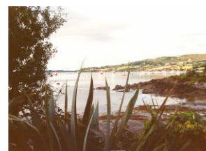
S97 Scenic Route