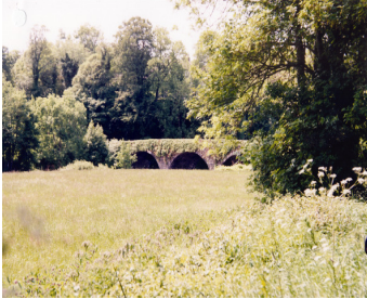
RPS No. 00293 Killavullen Bridge