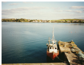
S102 Scenic Route