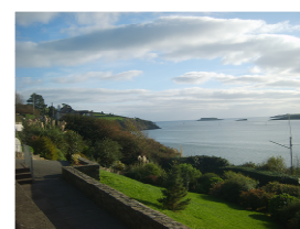
S81 Scenic Route