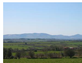
S17 Scenic Route