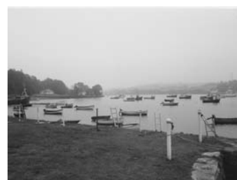
pNHA - 1547 Castletownsend