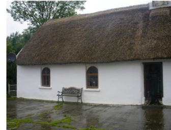
RPS No. 00111 Thatch House