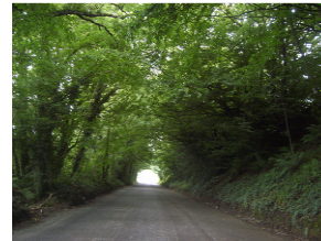
S65 Scenic Route