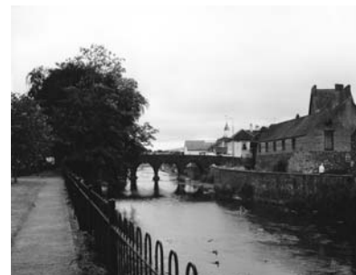
Kanturk ACA (part of)