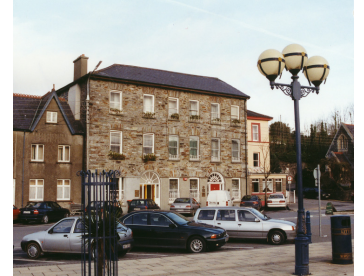
RPS No. 00927 Townhouse – O Mahony Farrelly, Bantry