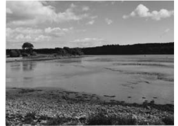
pNHA - 1990 Owenboy River