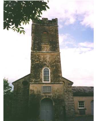
RPS No. 00074 St. Colman's Church, Farahy