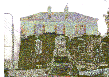
RPS No. 01206 Detached House at Egmont Place