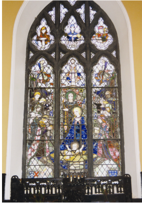
RPS No. 00788 St. Barrahanes Church of Ireland (Harry Clarke Windows)