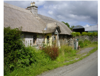
RPS Nos. 00268 Thatch House Gortmore