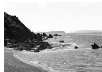
cSAC - 0101 Roaringwater Bay & Islands