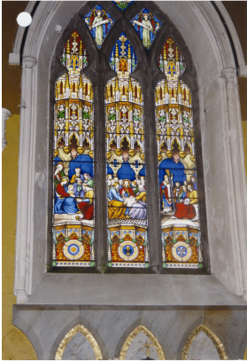
RPS No. 00628 St. Mary's Catholic Church