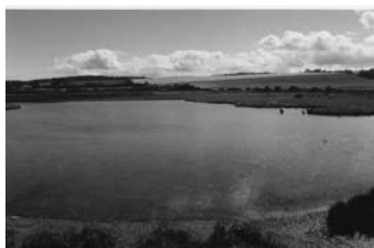
pNHA - 1547 Castletownsend