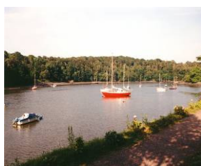
S58 Scenic Route