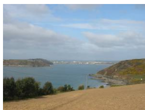
S51 Scenic Route