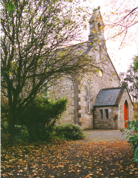
RPS No. 01005 Former Church of Ireland