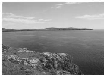
pNHA - 0109 Three Castle Head to Mizen Head