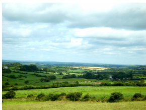
S36 Scenic Route