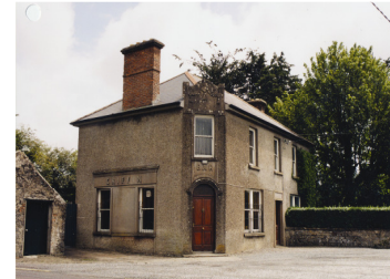
RPS No. 01242 Griffen's Bar