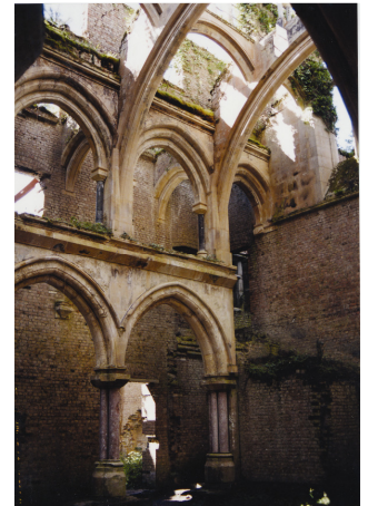
RPS No. 00764 Detail from Dunboy Castle Country House