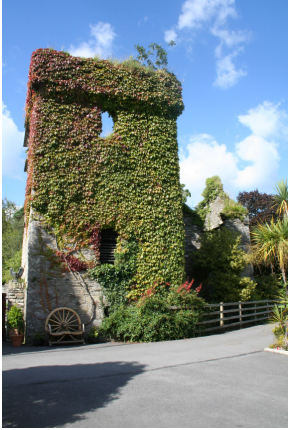
RPS Nos. 00368 Slieveveagh Ornamental Tower