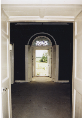
RPS No. 00343 Detail from Aghern House