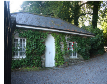
RPS Nos. 00895 Beach House Beach