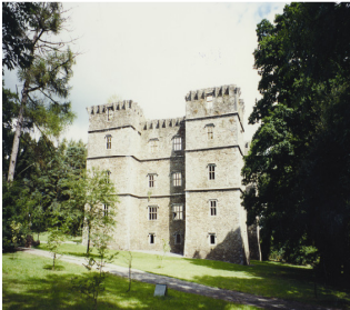
RPS Nos. 00178 Kanturk Castle