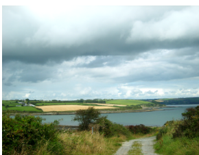
S70 Scenic Route