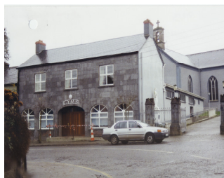
RPS No. 01213 CYMS Newmarket