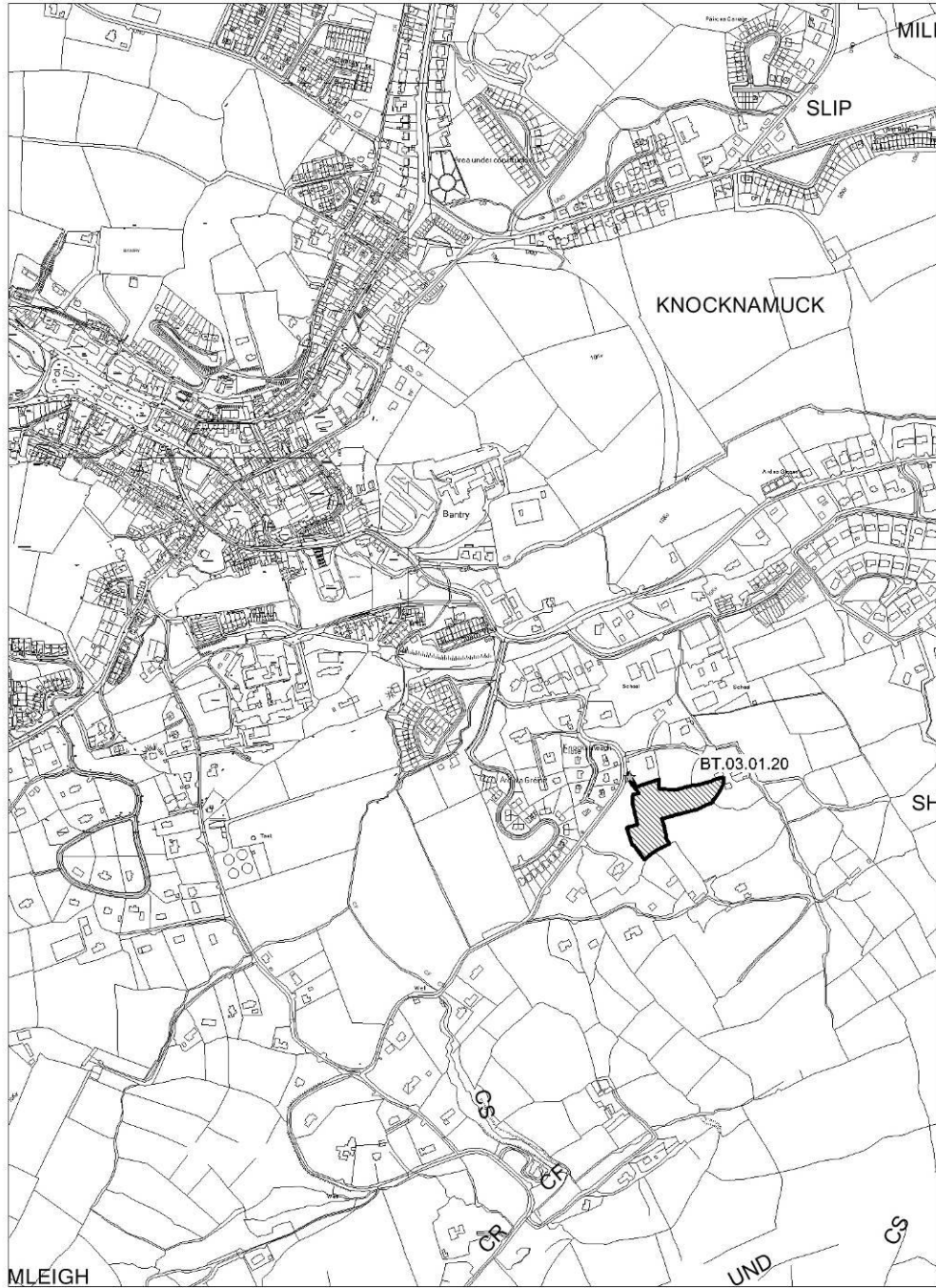
Managers Recommended Amendment Ref.BT.03.01.20