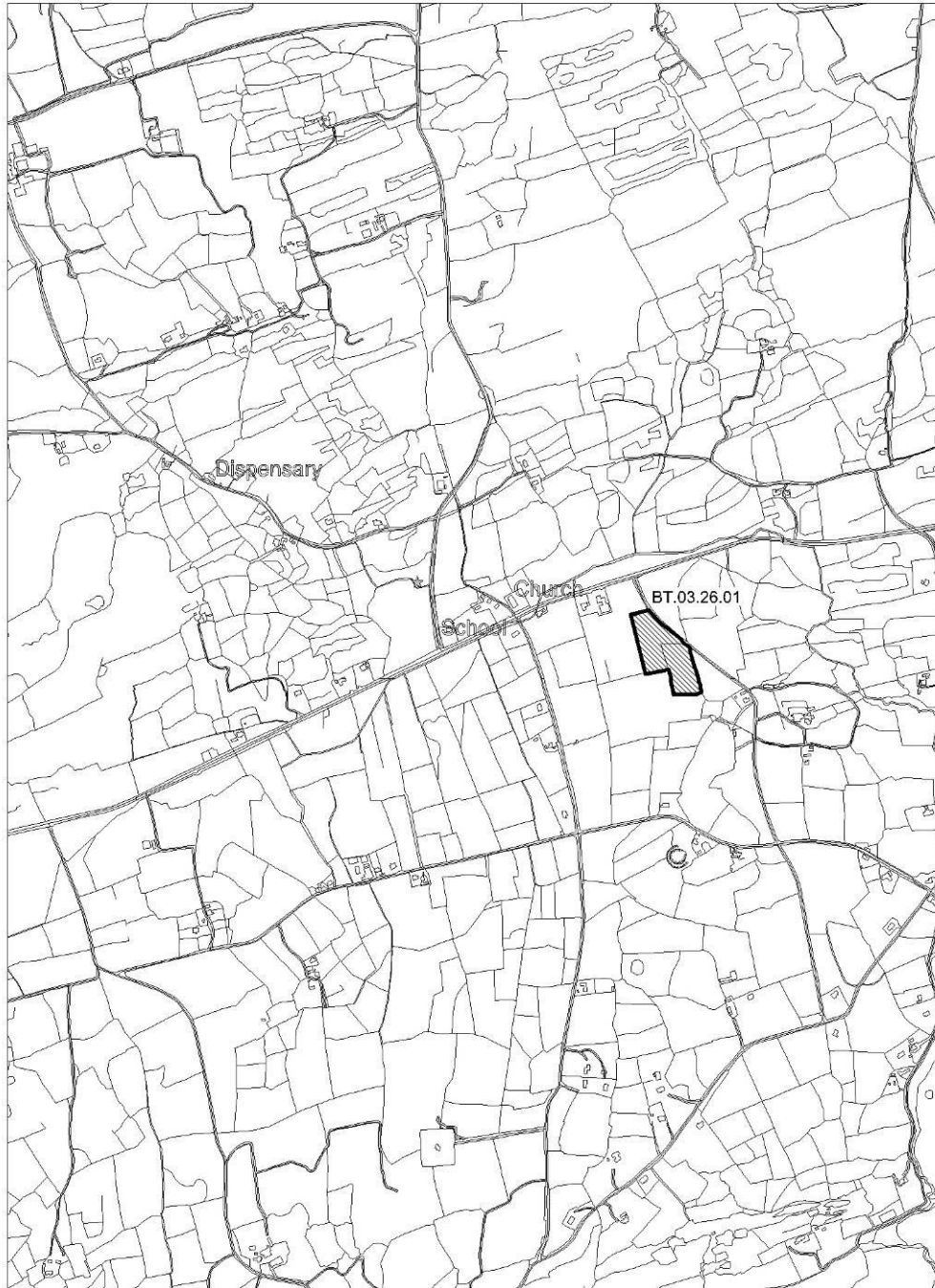
Managers Recommended Amendment Ref.BT.03.26.01