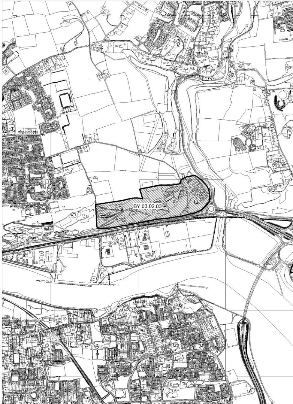
Managers Recommended Amendment Ref.BY.03.02.03