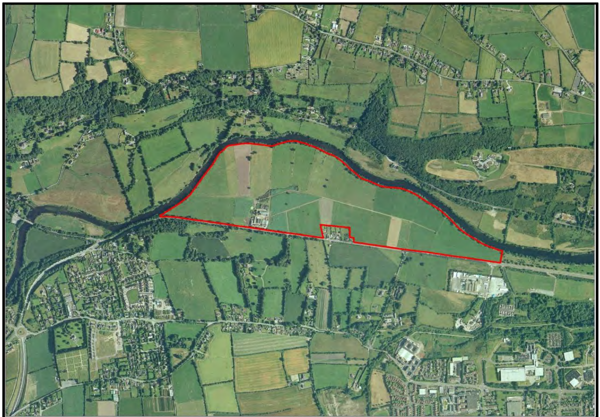
Figure 1 Site Location Map – A1 Greenbelt Carrigrohane Cork

Cork County Council proposes to amend the Macroom Electoral Area Local Area Plan under Section 20 of the Planning and Development Acts 2000 - 2010. The proposed amendment consists of the addition of new text and a new objective in order to facilitate the provision of a river walk and a park which would extend the existing amenity walk traversing the Lee Fields at Carrigrohane.