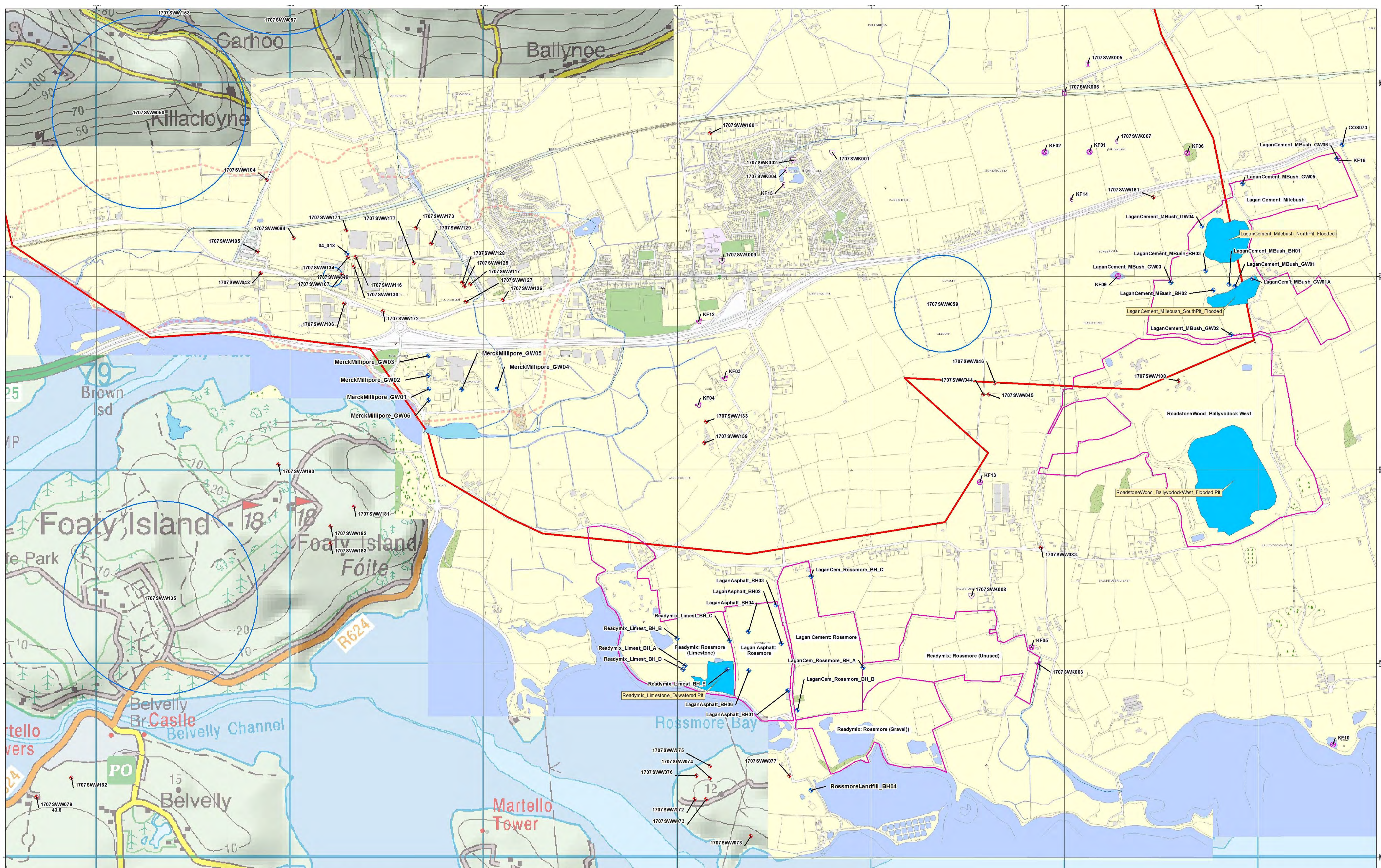
Figure 2A Data Points and Locations of Interest within the Western part of the Study Area