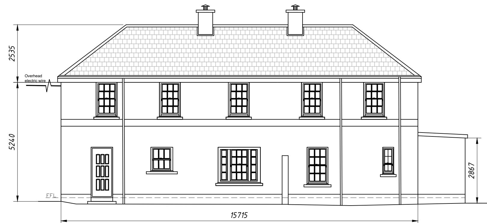
North Elevation SCALE 1:100