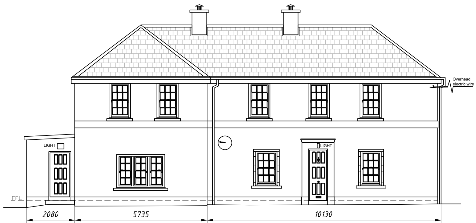
South Elevation SCALE 1:100