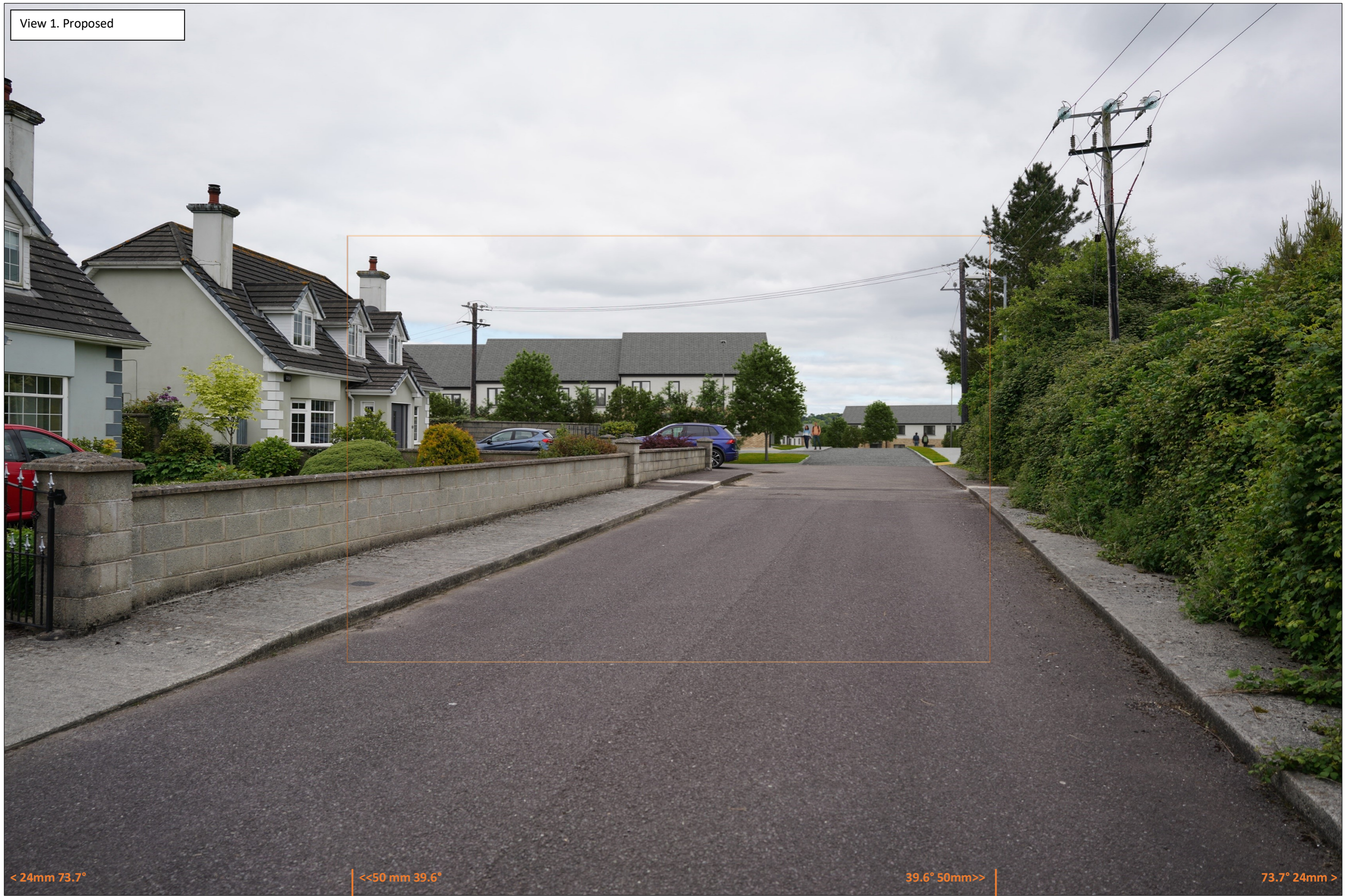
View 1. Proposed