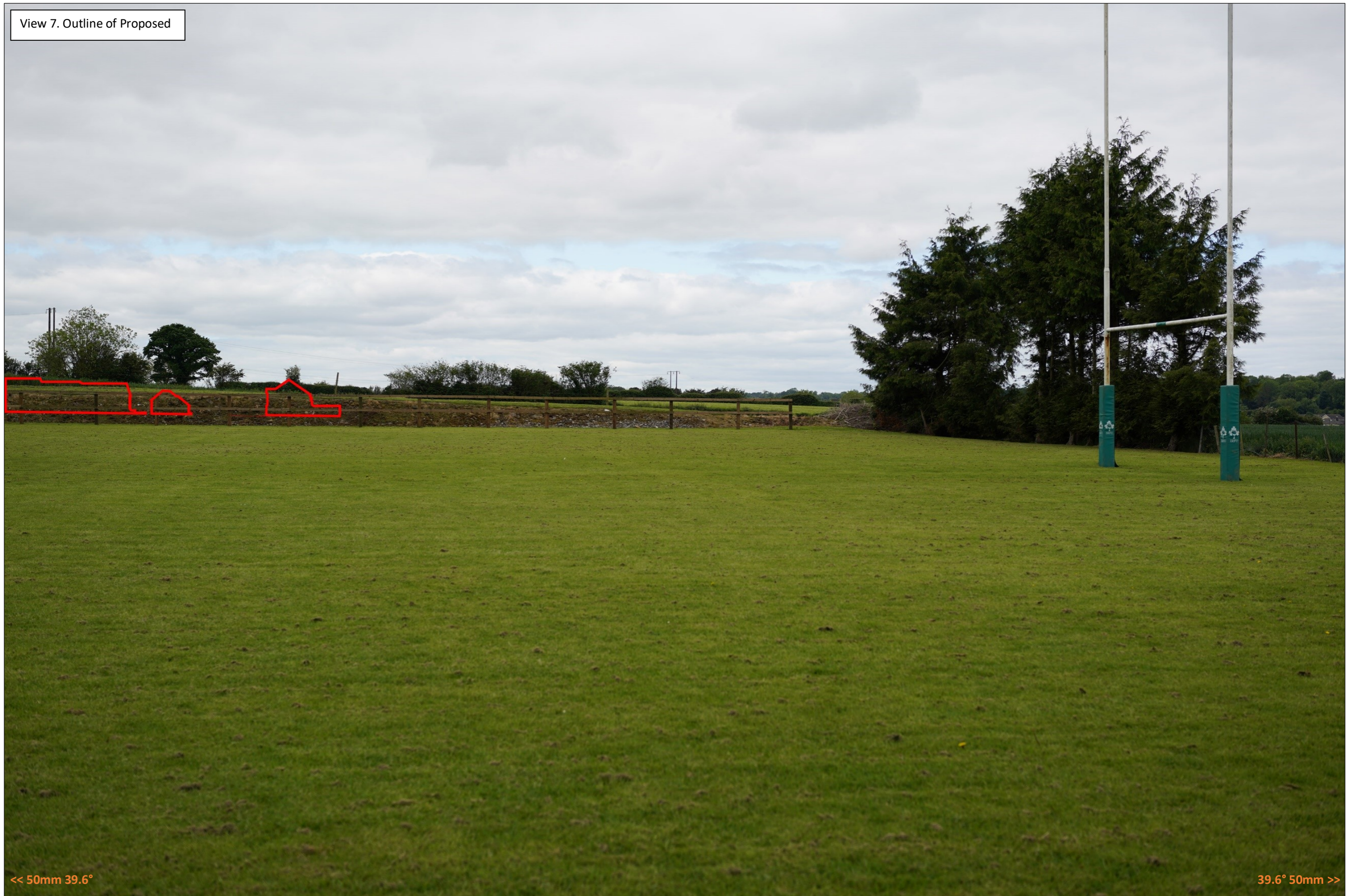
View 7. Outline of Proposed