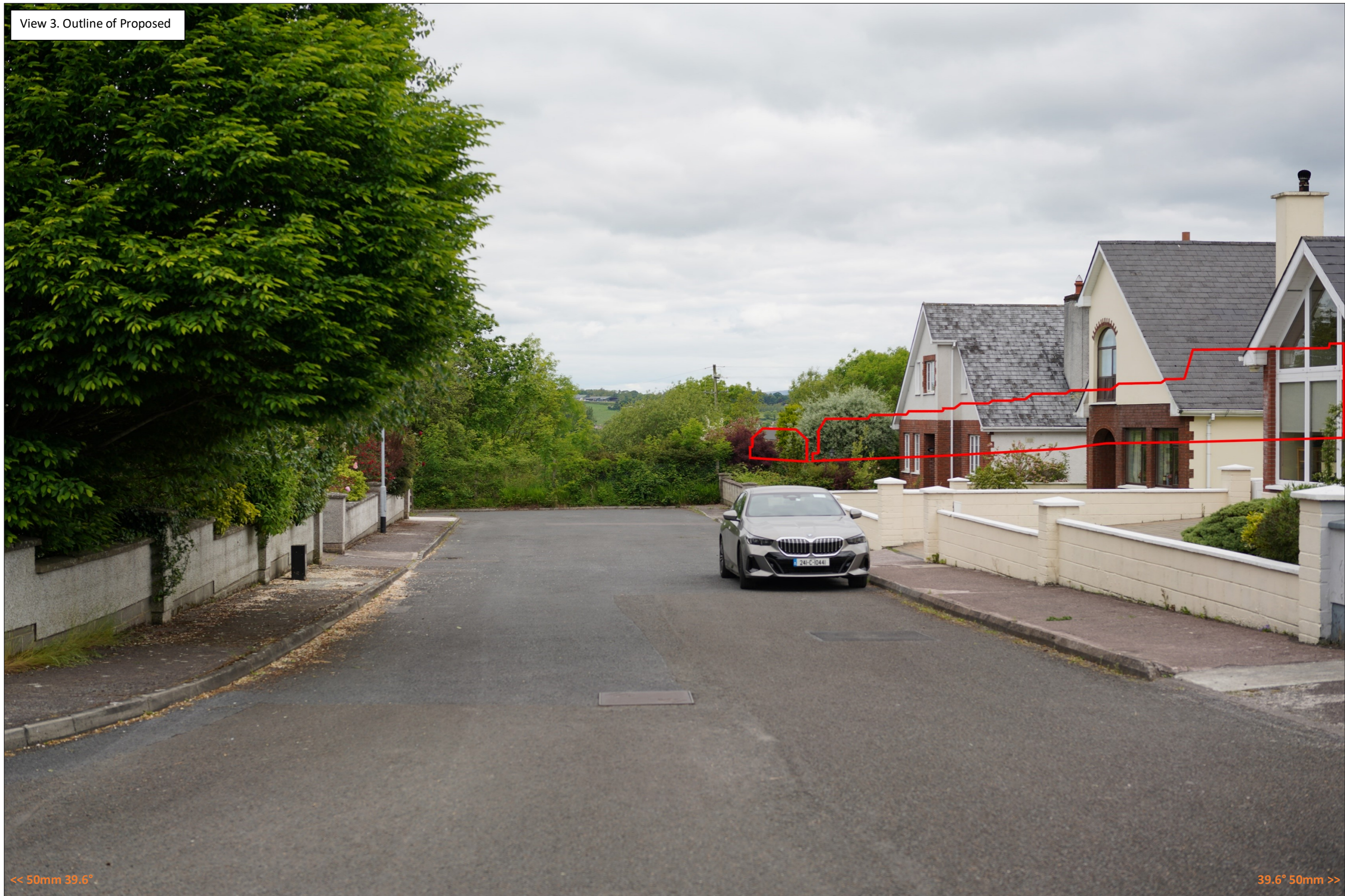
View 3. Outline of Proposed