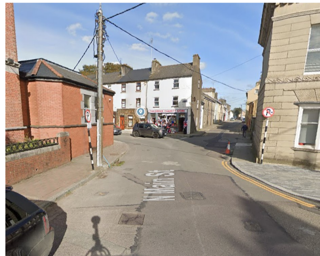
Photo of existing junction

Notes: 1. This drawing is for the purpose of the stage indicated only. - If in doubt ask. 2. Do not scale, figured dimensions only to be taken. 3. Engineer/Architect to be informed of any discrepancies before work proceeds. 4. Contractor to check all dimensions and conditions on site before commencing works. 5. Drawing to be read in conjunction with current Building Regulations. 6. All components and materials to be installed fully in accordance with manufacturers instructions.