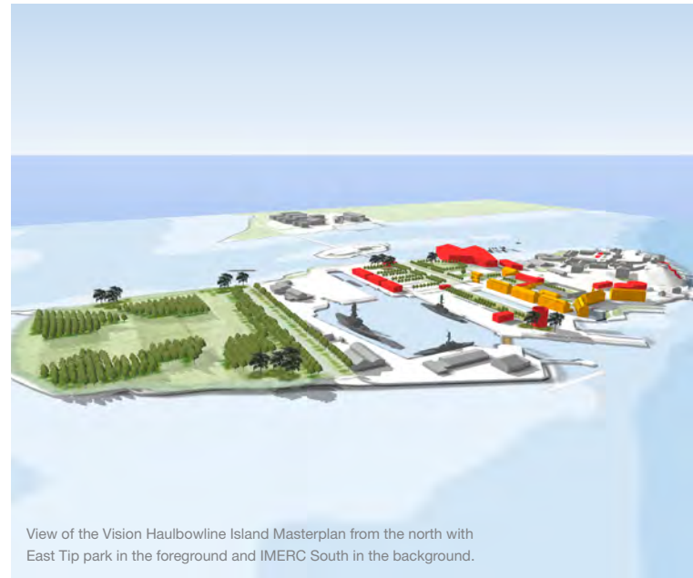
View of the Vision Haulbowline Island Masterplan from the north with East Tip park in the foreground and IMERC South in the background.