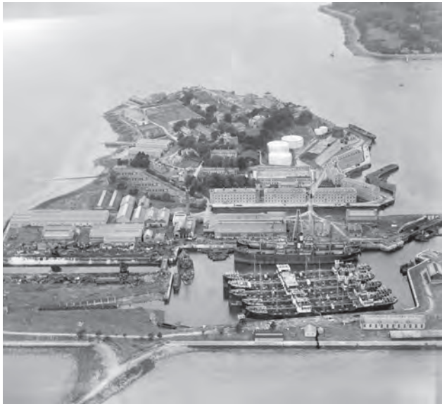
Aerial view of Haulbowline Island from the east in 1933, showing the dockyard in intensive use. Also note the existence of the East Camber water way adjacent to the Store Houses, enabling quayside access into the centre of the island.

The island is above all a unique place. It is both natural and solely man-made. The island has now the opportunity to become a pilot project for best practice.