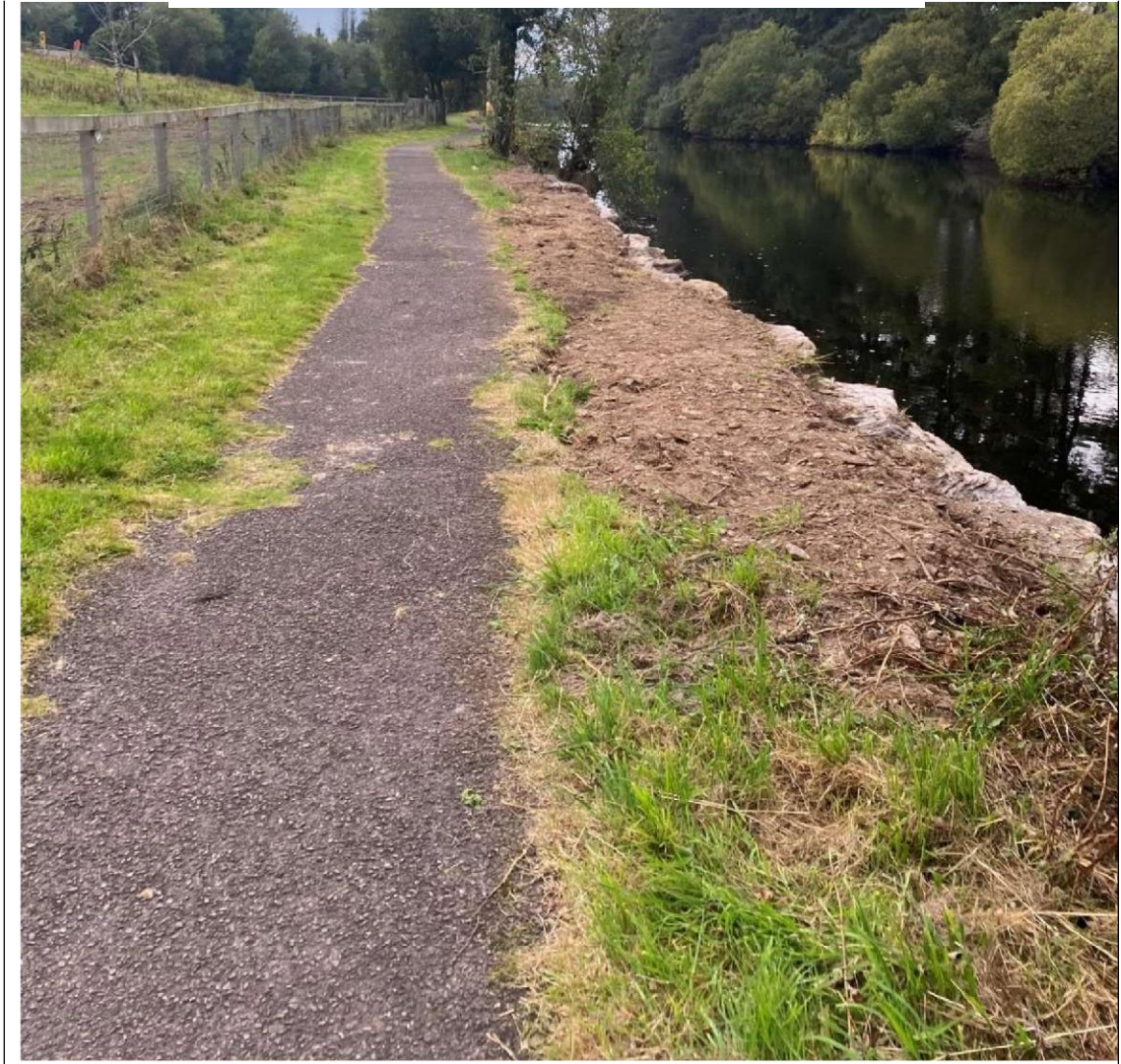
Figure 4 Before