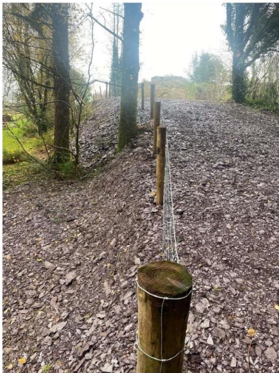
Figure 5 After