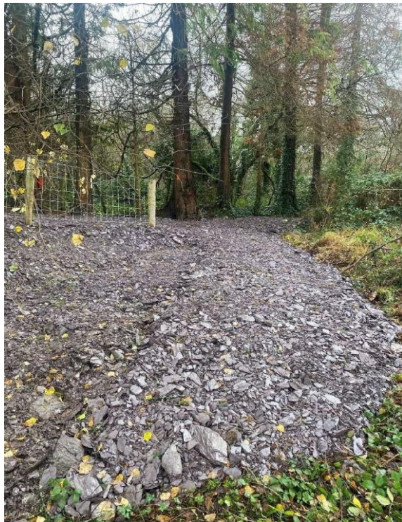
Figure 7 After