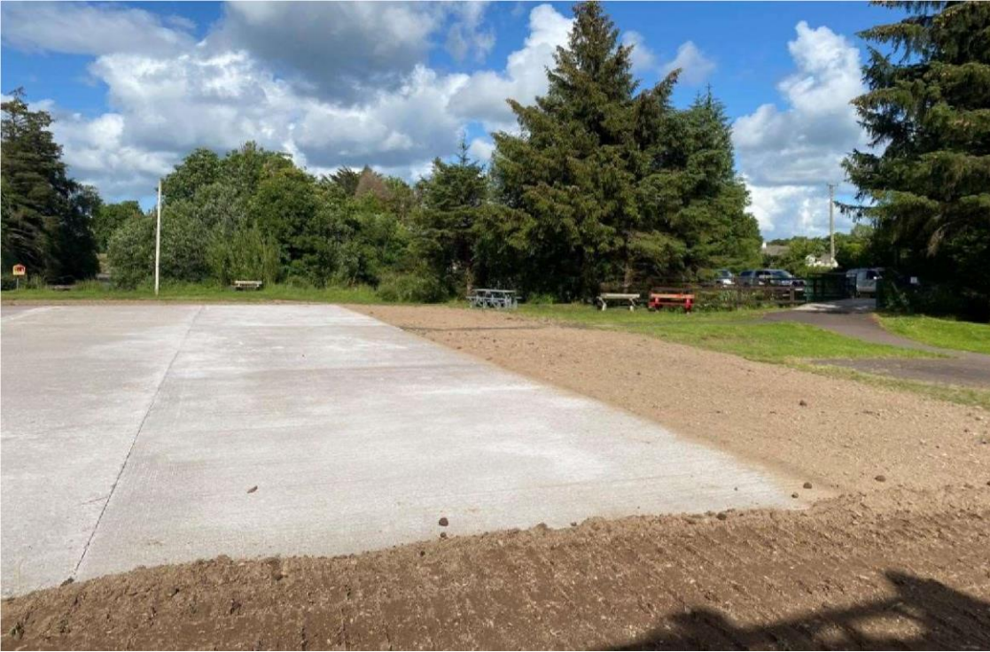
Figure 6 After