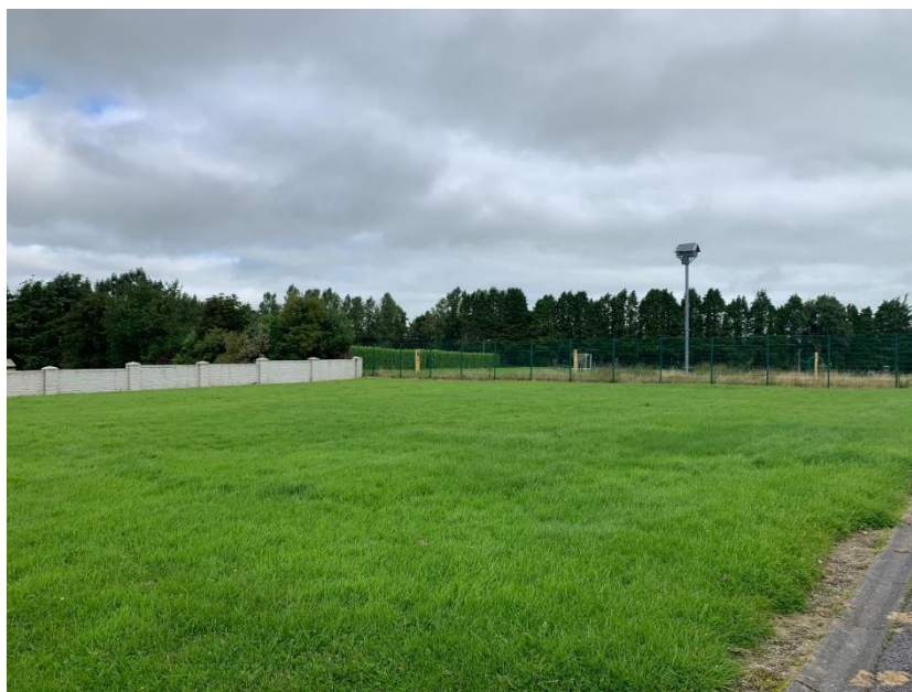
Figure 1 Before