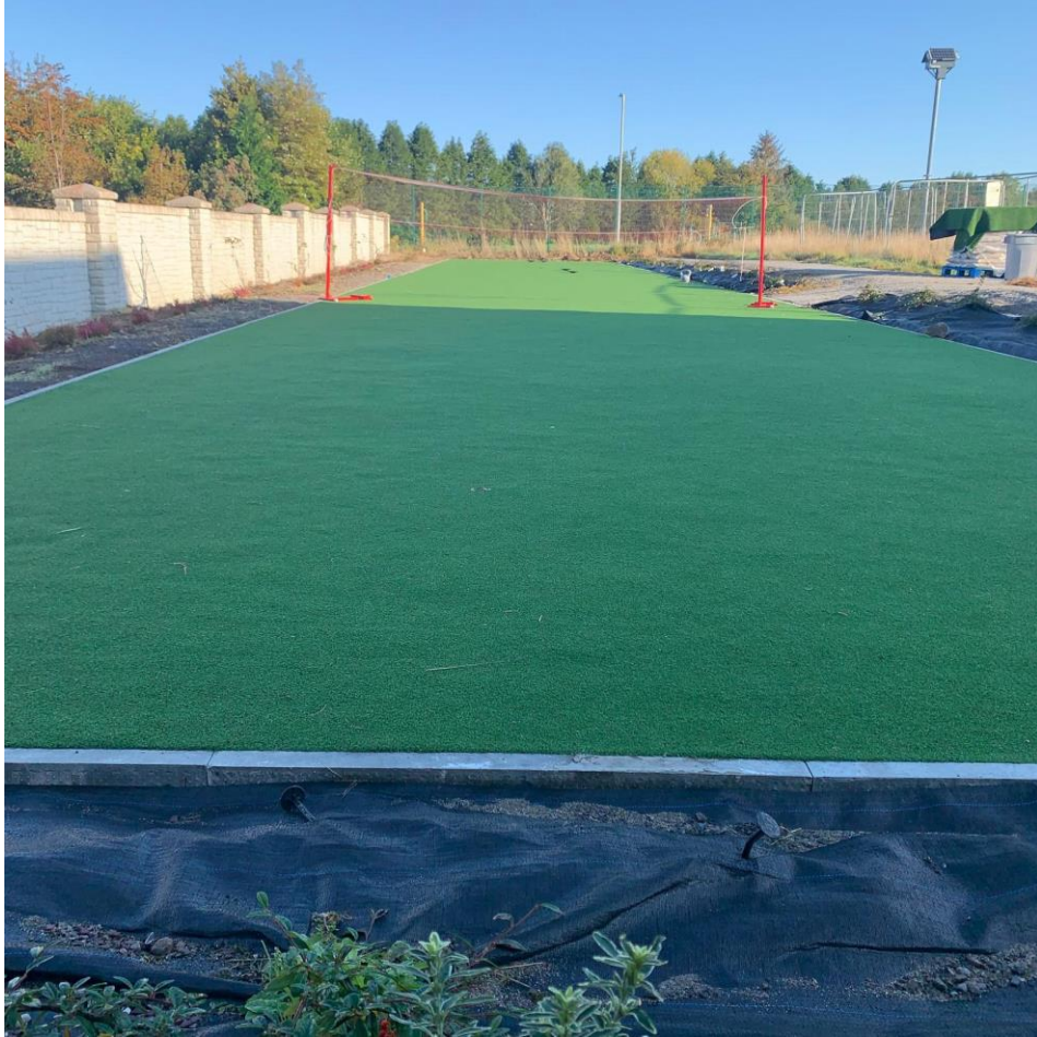
Figure 2 After