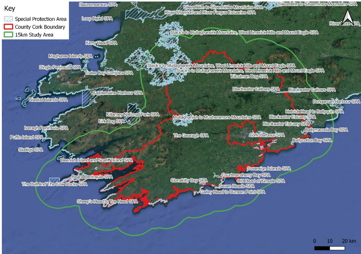
Figure 4-2: SPA Sites within County Cork