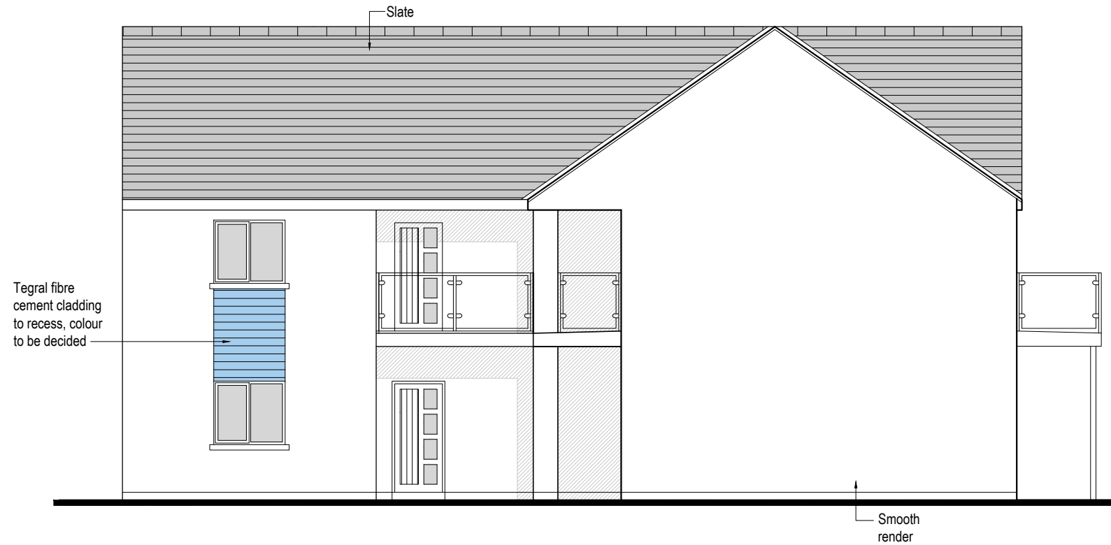
North East Elevation, SCALE : 1:100