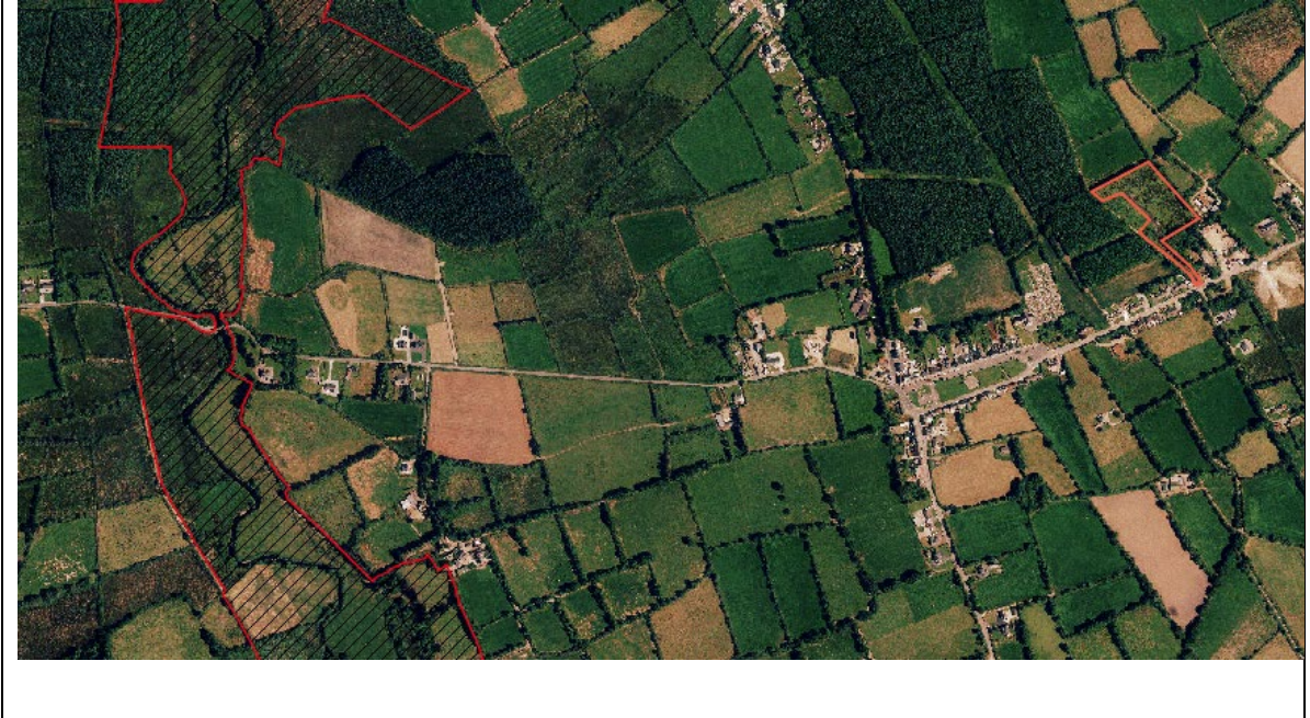
Figure 1 Site location

The proposed development site is located to the northeast of Knocknagree in the townland of Park. The site is situated off L1108 along an existing tramway. There are a number of single dwellings along the L1108 as well as the farmhouses and yards to the south of the site. The landscape around the site is rural in nature. The site is comprised of improved agricultural grassland with poorly drained area, indicated by rush, and is bound by hedgerow along the north and east and a conifer plantation along the west.